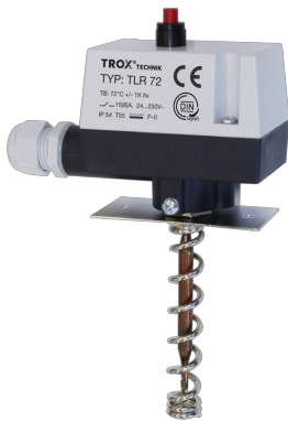
CAPILLARY TUBE SENSOR