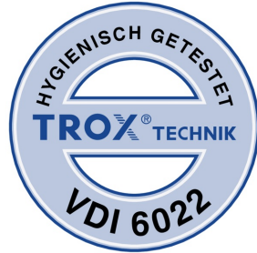
TESTED TO VDI 6022