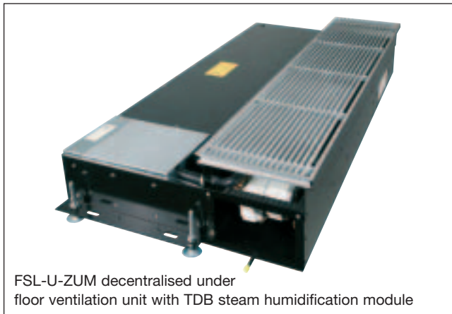
FSL-U-ZUM decentralised under floor ventilation unit with TDB steam humidification module