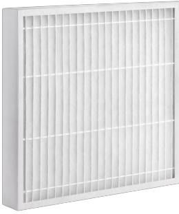
Z-LINE FILTER, CONSTRUCTION NWO