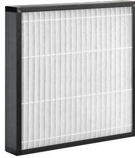
Z-LINE FILTER, CONSTRUCTION PLA