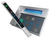
Beleuchtungsschaltung über Bedieneinheit