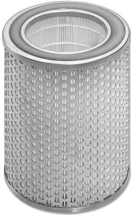
MINI PLEAT FILTER CARTRIDGE, TYPE MFCA