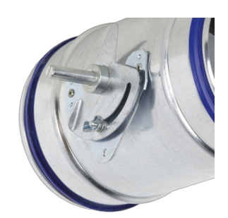
VARIANT FOR MANUAL OPERATION