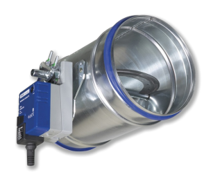
SHUT-OFF DAMPER, VARIANT AK, WITH ACTUATOR