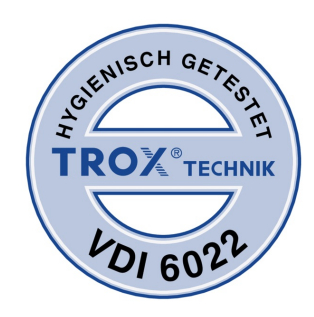
TESTED TO VDI 6022